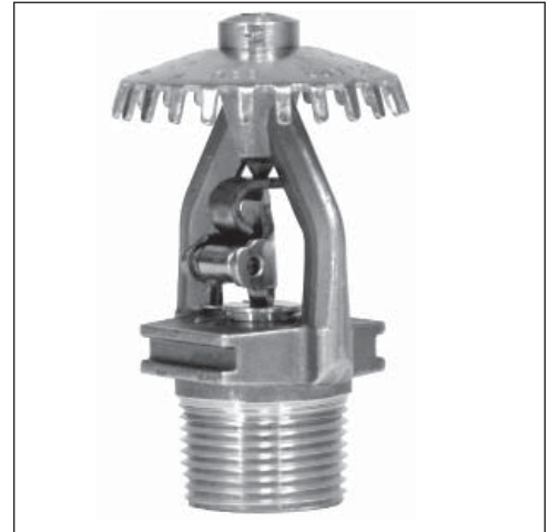
Sprinkler Identification Number RA1124